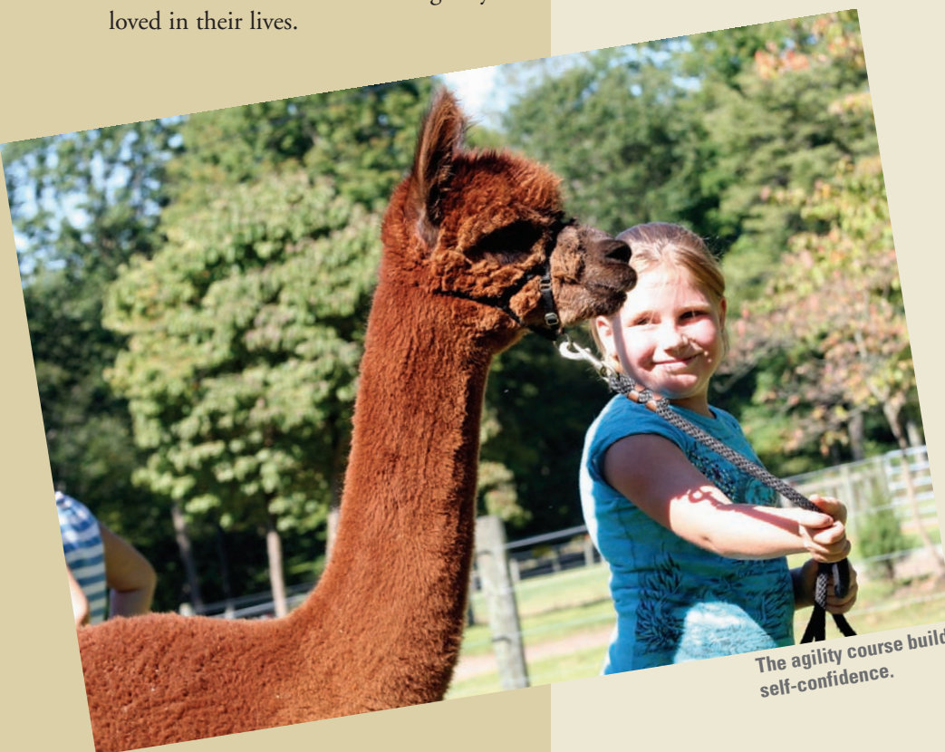
The agility course builds self-confidence.

When the alpacas first approached, the girls became quiet and wore serious faces. Two actually backed away. As the girls petted and hugged the alpacas, though, conversations started and smiles spread across their faces.