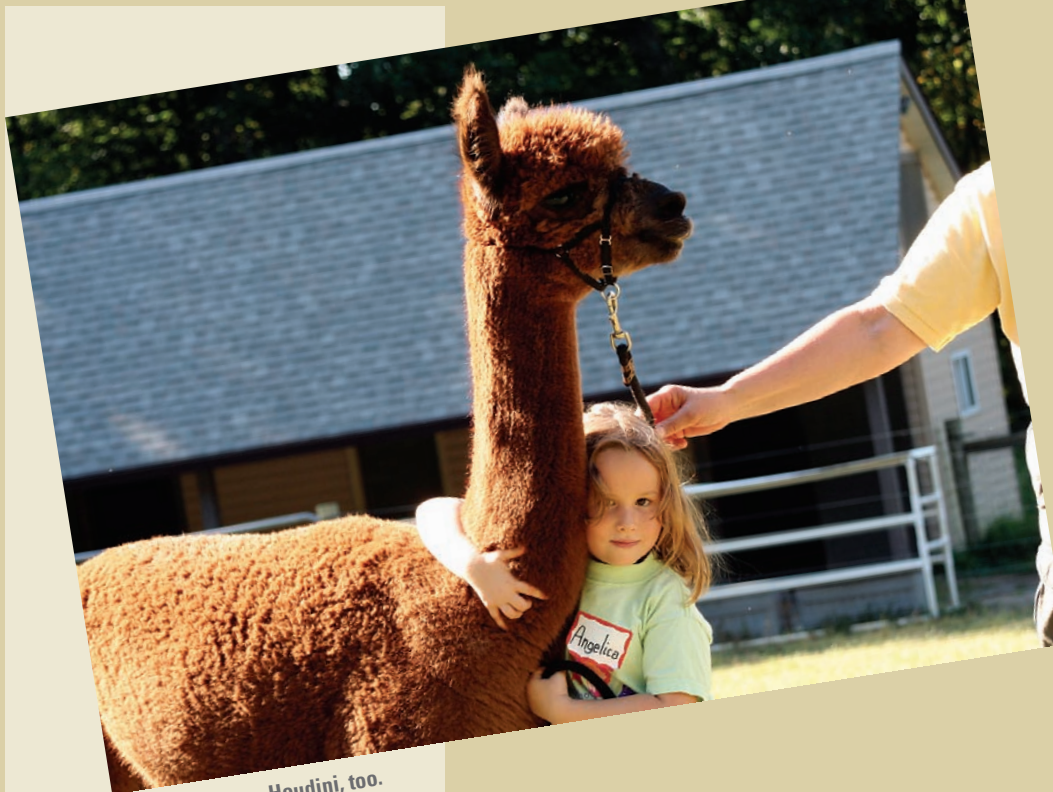
5-year-olds love Houdini, too.

Four alpaca farmers led the two teams, using four super-friendly, in-your-face alpacas. It commenced with all adults and girls forming a big circle, facing one another. To build a sense of community, they introduced themselves and shared something they loved in their lives.