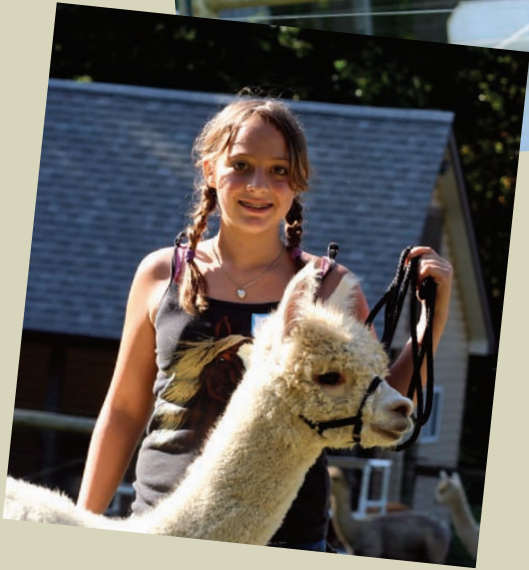
Center: At the end of the course, each girl stood with her alpaca for a picture and acknowledgment of her success.